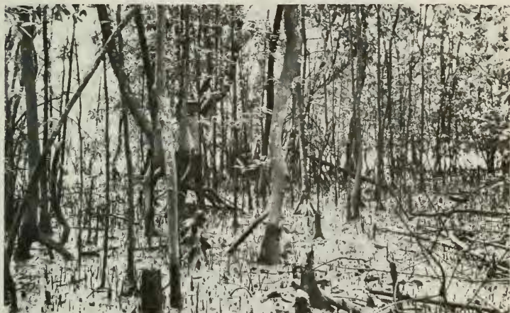
Fig. 5. General view of Avicennia officinalis forest in Sarawak

exine projected outward, and devoid of any ornamentation. Mean apocolpium diam. 11 \mu . Prolate-spheroidal to spheroidal, P/E about 32 \mu x 31 \mu (range 27.5 \mu — 36 \mu x 26.5 \mu — 36 \mu ). Exine 3.5 \mu thick. Sexine 2.5 \mu thick, reticulate, intectate, muri simplibaculate, rarely duplibaculate, heterobrochate, lumina polygonal, dimension gradually becomes smaller towards the aperture. Bacula provided with distinct globular knoblike head. Nexine 1 \mu thick, tenuixinous. NPC classification 345."